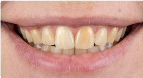
Before Boutique Whitening