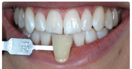
After Boutique Whitening