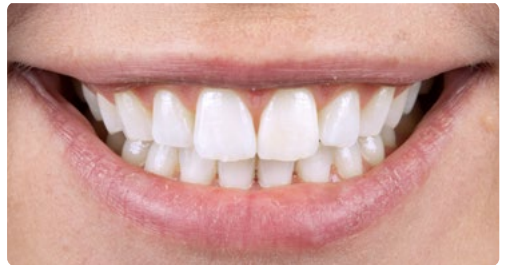
After Boutique Whitening