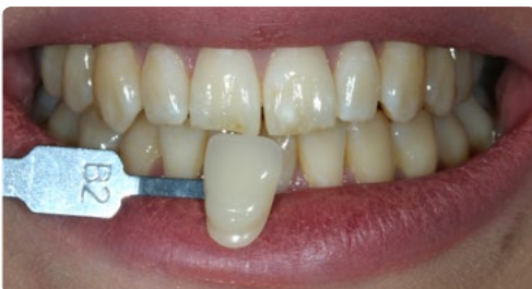
Before Boutique Whitening