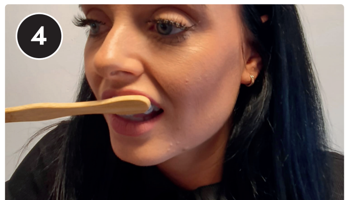
4 Remove any excess gel with a tissue or a soft dry brush.