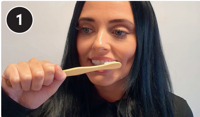
1 Brush and floss your teeth.